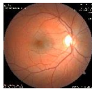
View through undilated pupil